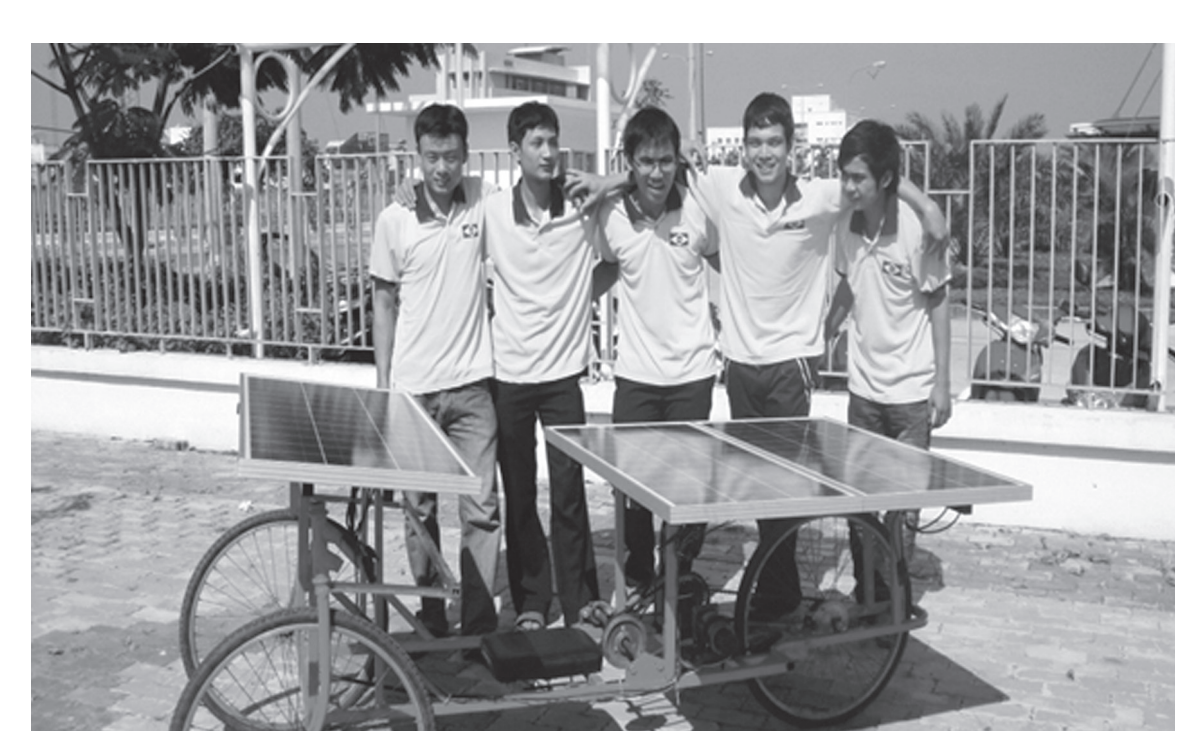
Note: Students at the University of Agriculture and Forestry show the "solar car" that they invented.

Email: avu@worldbank.org Website: www.worldbank.org/vn